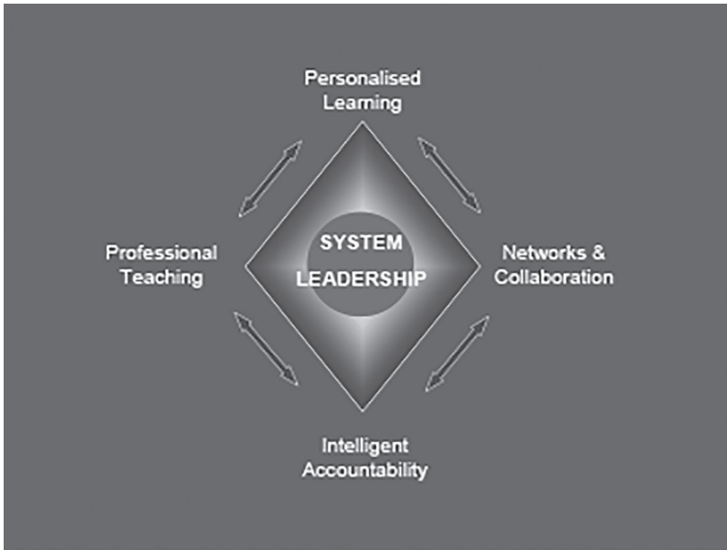
Figure 3 Four key drivers underpinning system reform

proposal here is to identify a limited number of domains for reform, within which the twenty actions could be coherently brigaded. The four drivers of personalised learning, professionalised teaching, networks and collaboration and intelligent accountability provide the core strategy for systemic improvement in most high-performing, ‘good to great’ educational systems. They are the canvas on which system leadership is exercised. As seen in Figure 3, the ‘diamond of reform’, the four trends coalesce through the exercise of responsible system leadership. To reiterate the two crucial points: first, single reforms do not work – it is only clusters of linked policy initiatives that will provide the necessary traction; second, it is system leadership, however, that drives implementation and adapts policies to context.